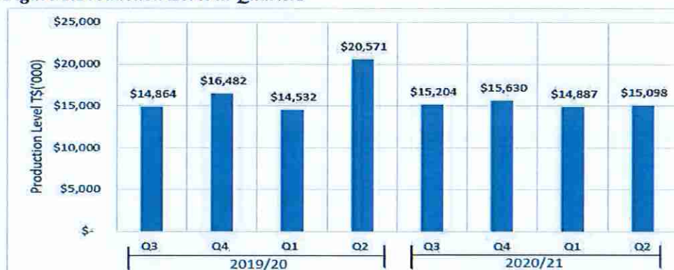
Figure 1: Production Level in Quarters

Note: ISIC 37 Includes 16,17,18,19,20,21,25,29,30,31 and 35